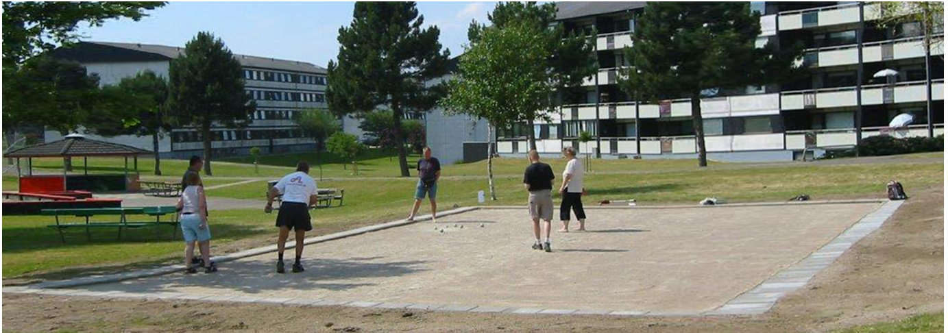
In 2008, electronic heat cost allocators and water meters read remotely by BrunataNet AMR were installed at the flat-owners' association Tyreengen.